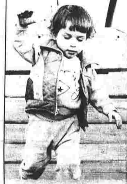
playscape Thursday. He fell along the way but picked himself up and concluded his mission.